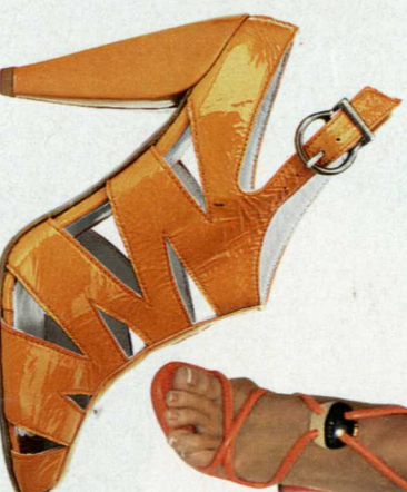
Shoes, £160, Paco Gil, tel: 07887-548047