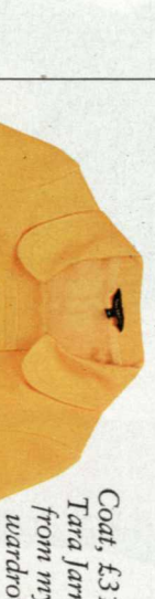
Coat, £318, Tara Jarmon, from my- wardrobe.com

The future is orange in a cocktail of mouthwatering shades. Splash it on all over or enjoy a taster with some key pieces