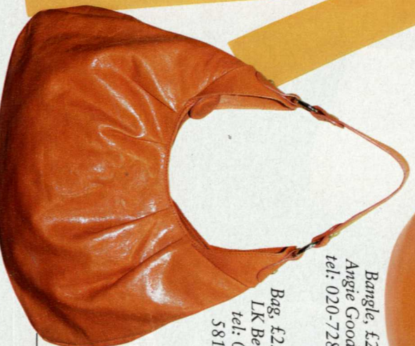
Bag, £229, LK Bennett, tel: 0844- 581 5881